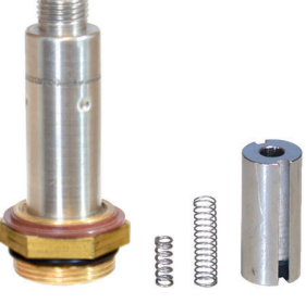
Service kits available