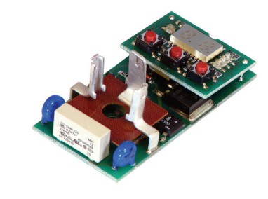
Digital processor, offering you exceptional time cycle accuracy