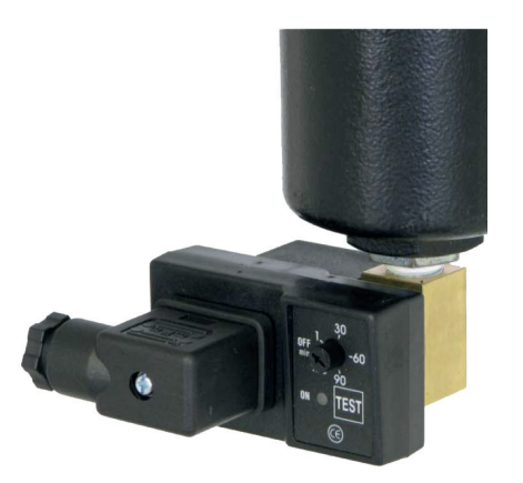
Inline installation under compressed air filters