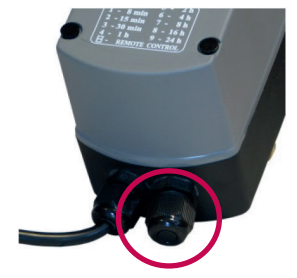
Remote switch feature