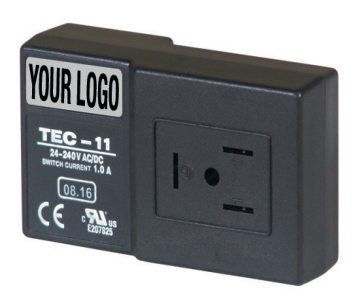
Private labelling available