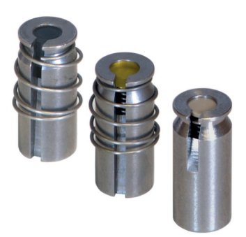
The right seal for the right job