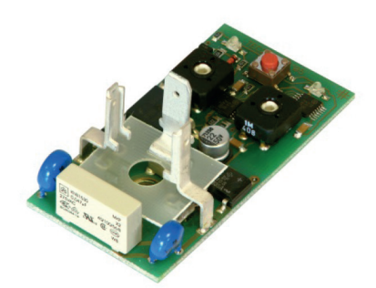
Highest quality PCB

o.5 – 10 seconds / o.5 – 45 minutes SMD technology, ensuring consistency in production Bright LED illumination