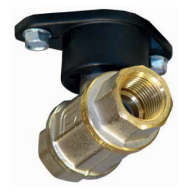
Brass nickel plated valve

7 seconds to 15 minutes ON / 4 minutes to 24 hours OFF SMD technology, ensuring consistency in production Bright LED illumination