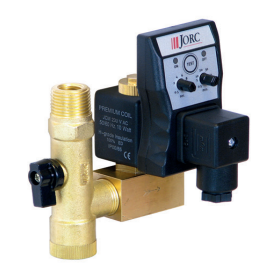
Accessories include ball valve strainers