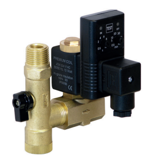
Accessories include ball valve strainers