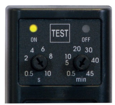
Bright LED illumination, indicating operating status