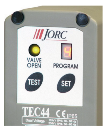
Bright visual display of selected program