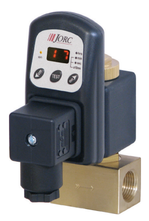
Also available in a FLUIDRAIN valve version