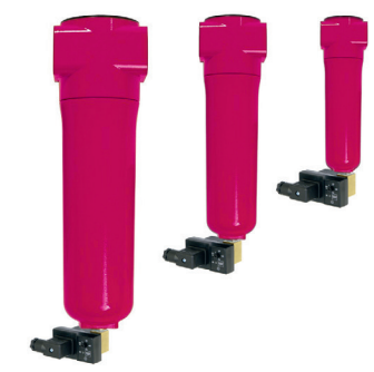
Install under any filter