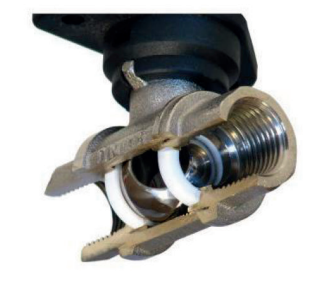
Stainless steel rotating ball