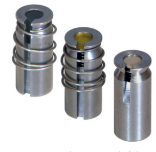
Service kits available