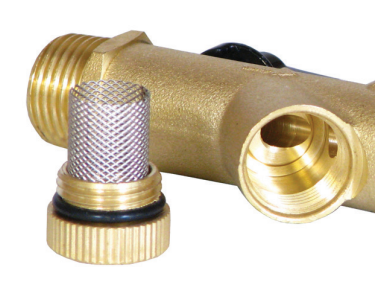
Integrated mesh strainer