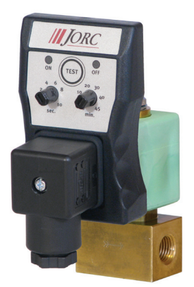
Environmentally friendly low Watt version available