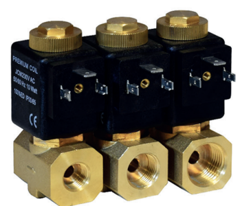
Various valve connection options

o.5 – 10 seconds / o.5 – 45 minutes SMD technology, ensuring consistency in production Bright LED illumination